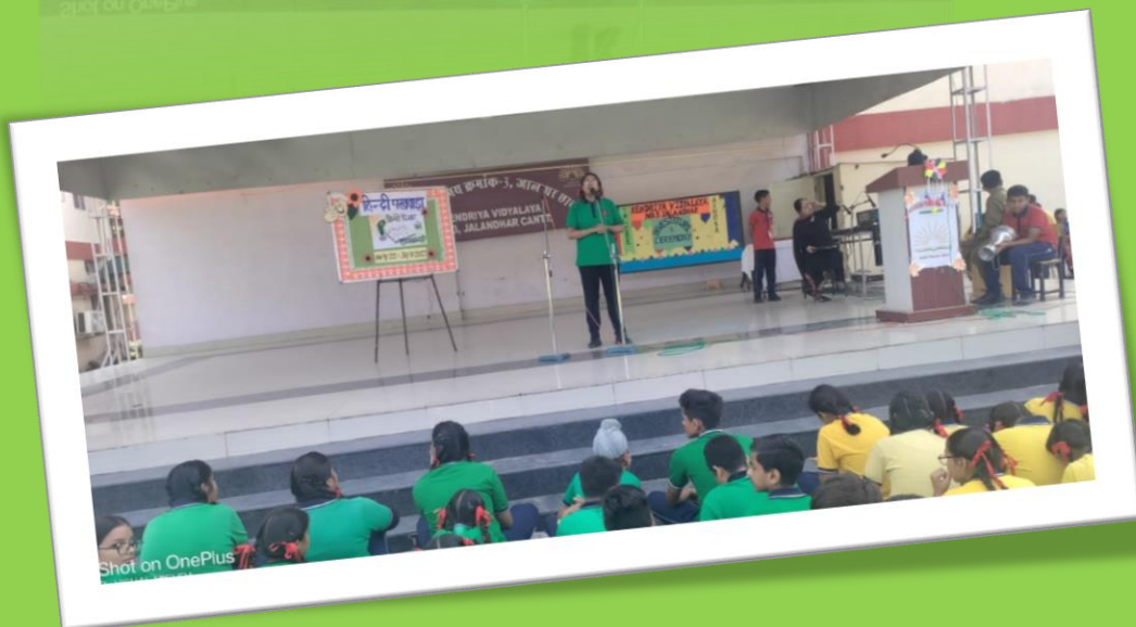
Shot on OnePlus