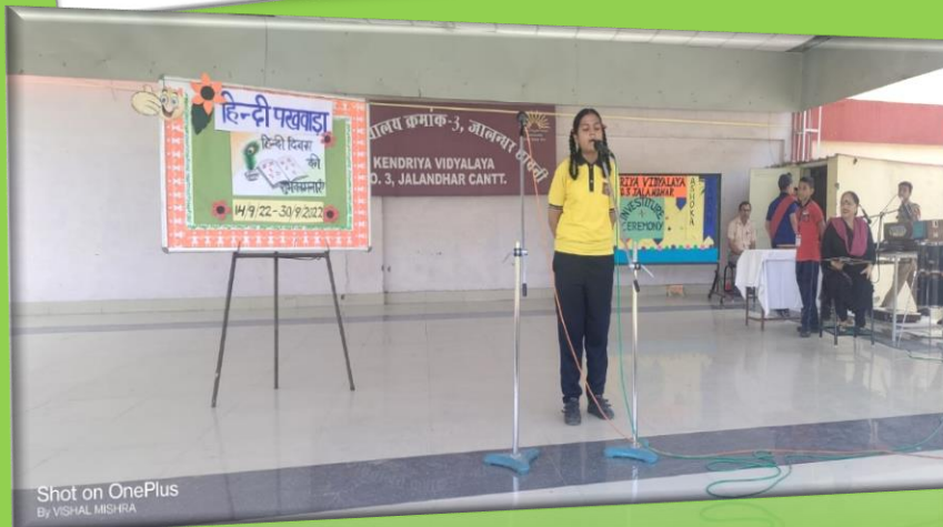
Shot on OnePlus By VISHAL MISHRA